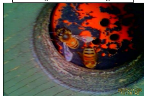
Site 5 bees on flap of large box