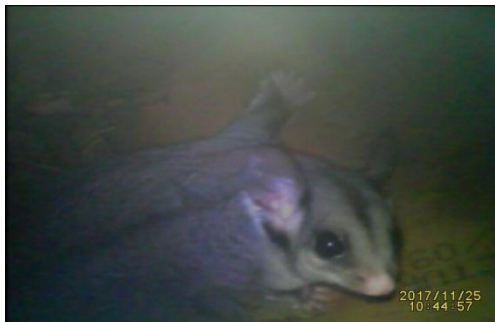
Site 3 large box

Site 10 Large box had at least 2 Sugar Gliders Small box had only dry leaves. Time approx 12.22 pm 2 AWO on way in.