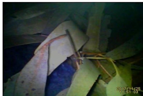
Site 6 Large box, at least one glider