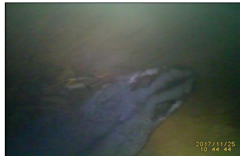
Site 3 large box