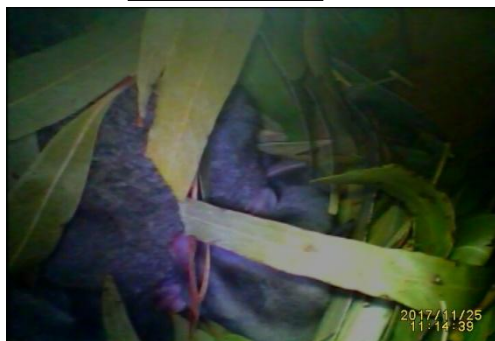
Site 5 small box