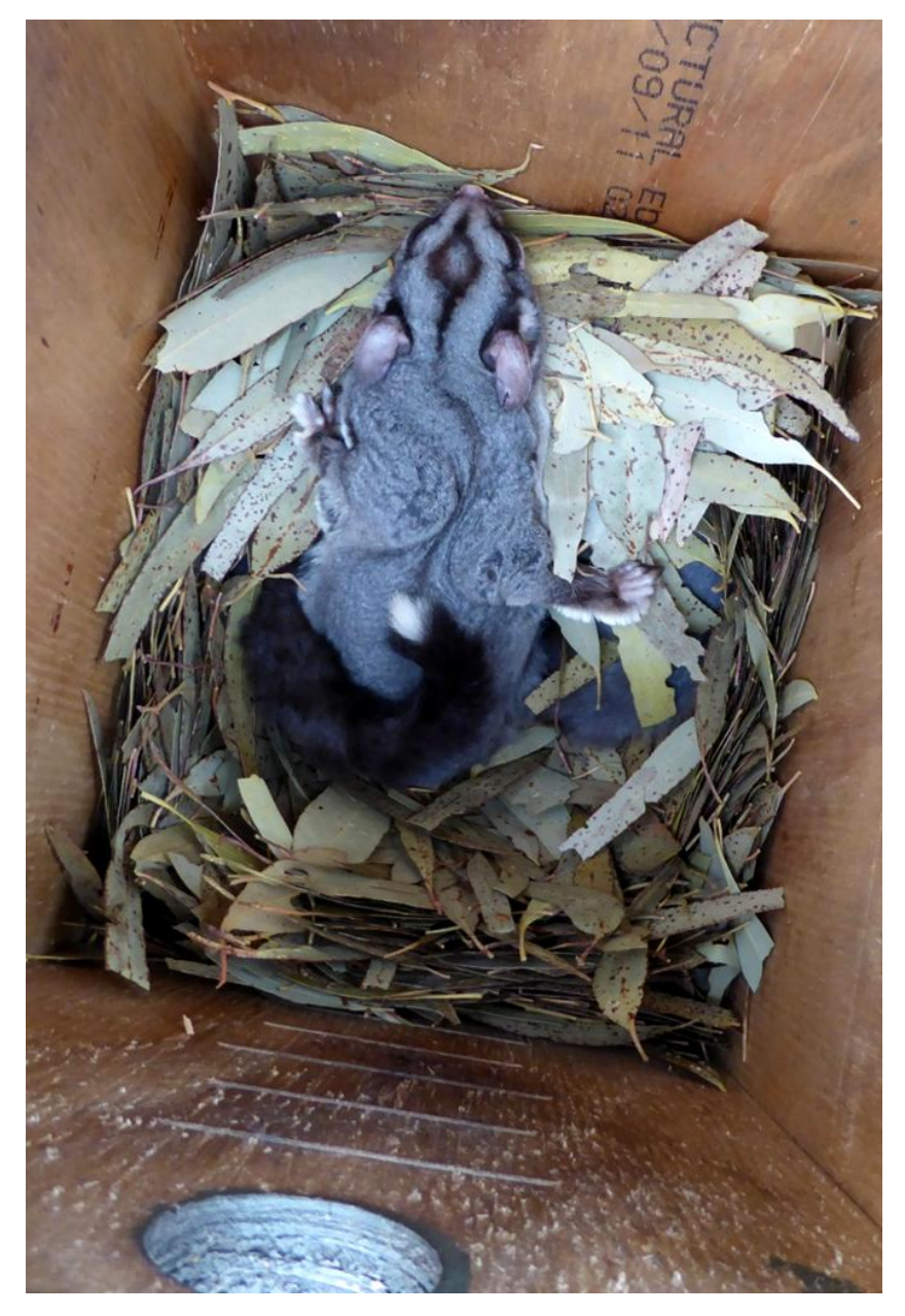
Site 3 . A large Sugar Glider asleep in a box.

Part of another animal may be glimpsed to one side.