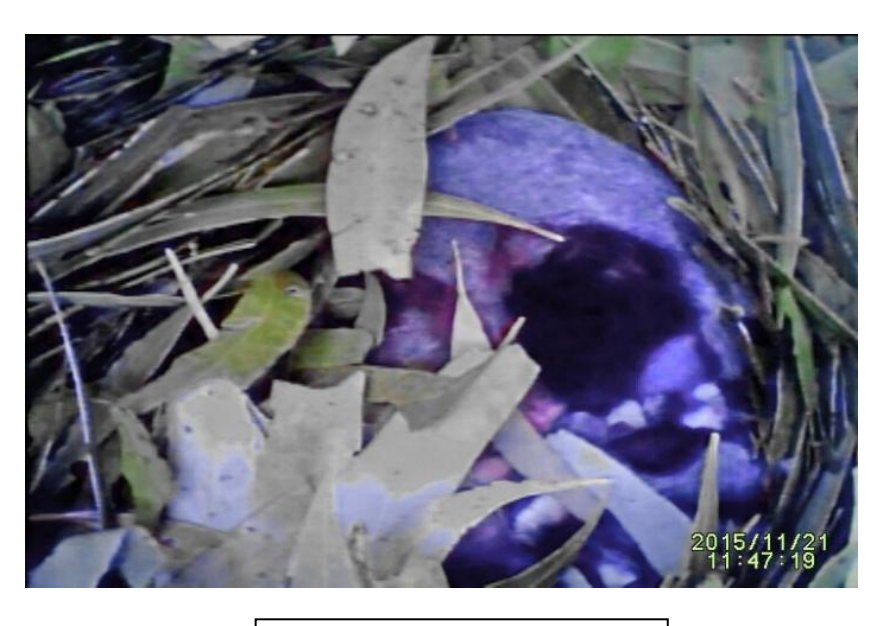
Site 5 . Photo from pole camera.

The photo shown here was taken with a digital camera, after using a ladder to reach the box and open the top.