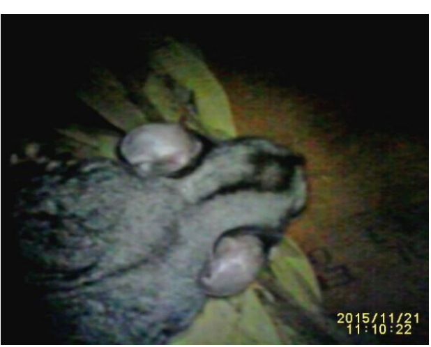
Site 3. Photo from pole camera.