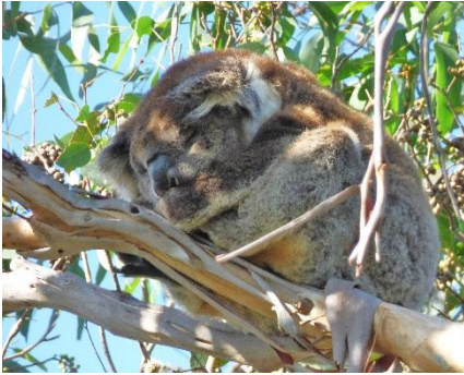
A very sleepy Koala near the campsite