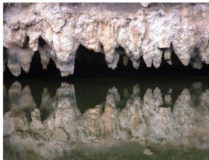
Limestone stalactites from now flooded and exposed caverns at the river’s edge (SM)