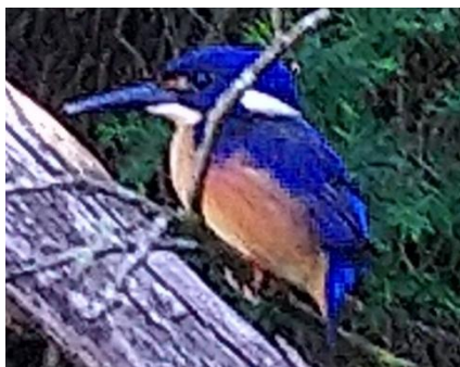
Azure Kingfisher (RZ)