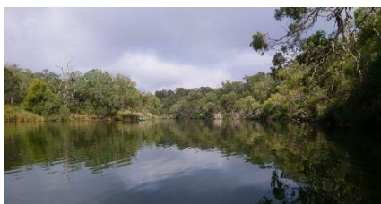
The Glenelg River (RZ)