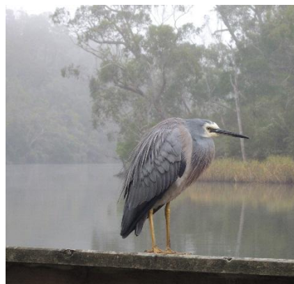
White-faced Heron (SM)