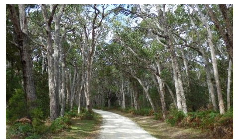
Brown Stringybark on the Glenelg Dr