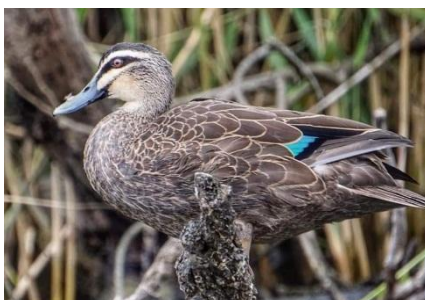
Pacific Black Duck (GT)