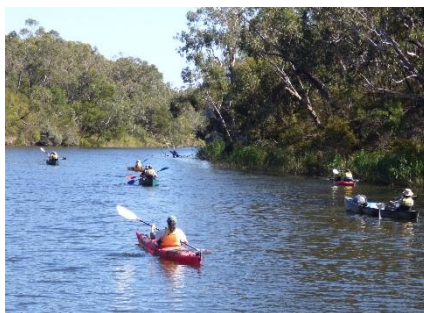
... and they are off