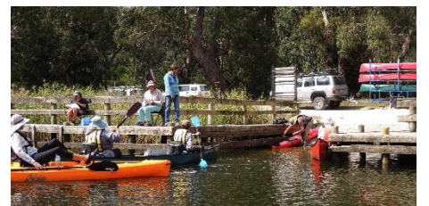
Arrival at Sapling Ck