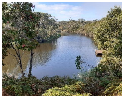
Looking down over Moleside Jetty

Sulphur-crested Cockatoo White-browed Scrub-wren White-faced Heron Yellow-tailed Black-cockatoo Echidna Snakes (2)