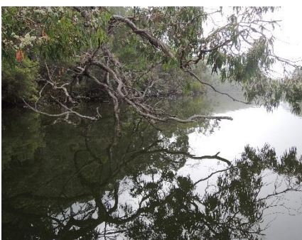
Eucalypt branches provide roosting spots for birds (SM)