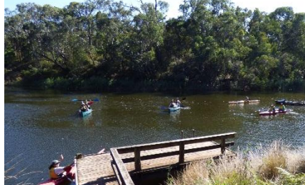
A wave ...