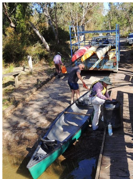
Arriving at Pritchards (SM)