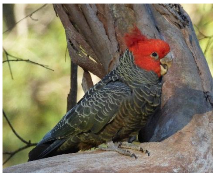
Gang Gang Cockatoo