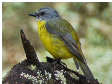
Eastern Yellow Robin