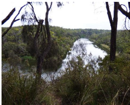
View near Battersbys – Glenelg Dr