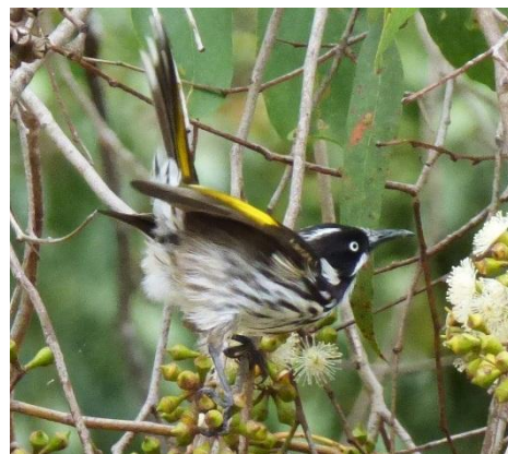
New Holland Honeyeater