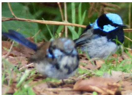
Superb Fairy-wren – immature and adult males