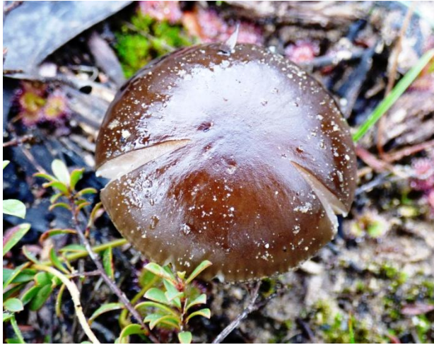
Rooting Shank – Oudemansiella gigaspora gp.