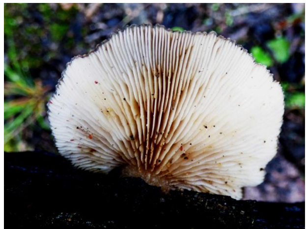
Unidentified gilled fungus

The birds were conspicuous by their absence. We saw or heard only 10 species: White-cheeked Honeyeater, White-throated Treecreeper, Forest Raven, Spotted Pardalote, Striated Pardalote, Pied Currawong, Grey Shrike-thrush, Grey Fantail, Australian Magpie and Wedge-tailed Eagle.