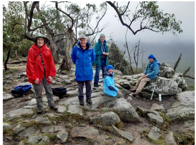
Some of the group at the summit