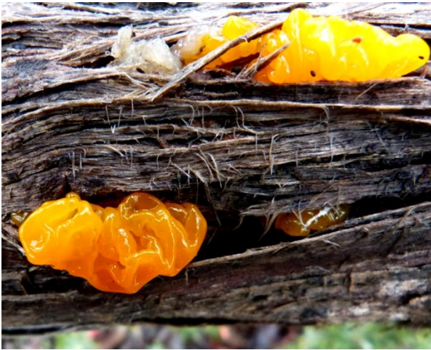
Golden Jelly – Tremella mesenterica