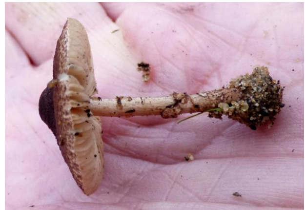
Parasol Mushroom – Lepiota sp.