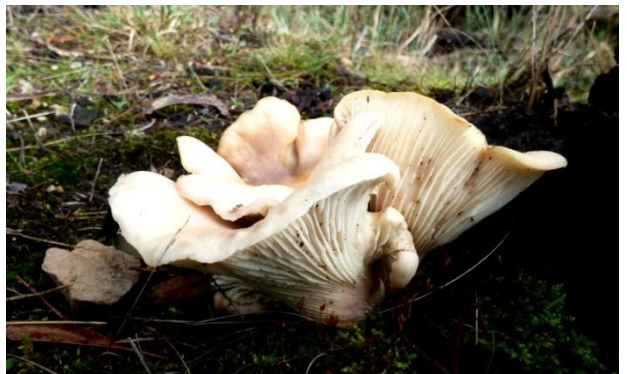
Ghost Fungus – Omphalotus nidiformis