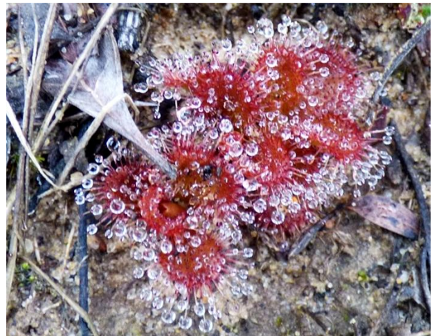
Rain drops on Scarlet Sundews