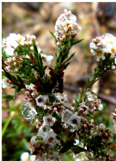
Pink Bearded Heath