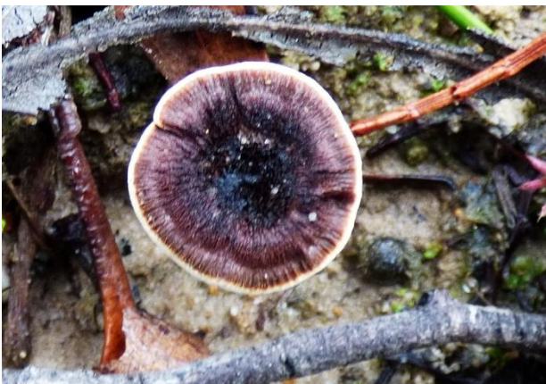
Fairy Stool – Coltricia cinnamomea