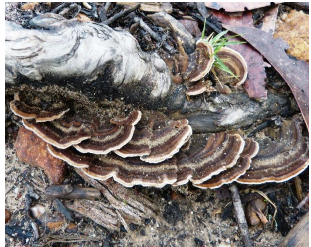
Rainbow Fungus – Trametes versicolor