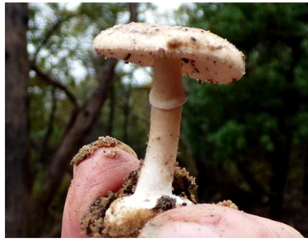
A death cap – Amanita sp.