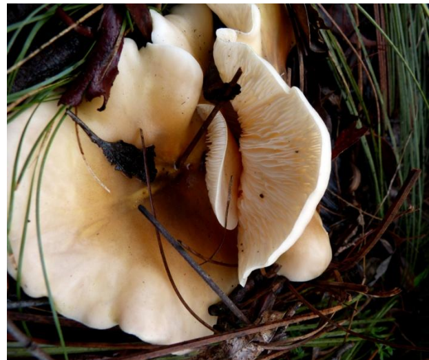
Ghost Fungus – Omphalotus nidiformis