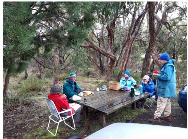
Picnic lunch at the car park