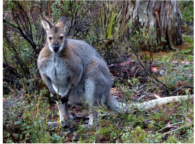
Red-necked Wallaby, male