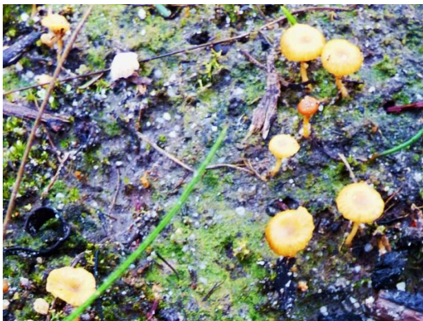
Yellow Navel – Lichenomphalia chromacea