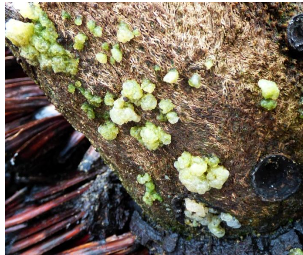
White Jelly – Tremella sp.