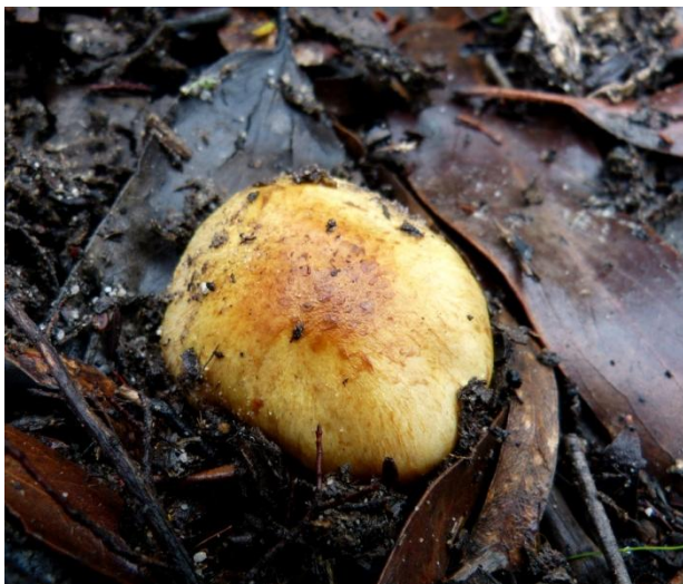
A Cortinarius ? – Cortinarius or Dermocybe sp.

The fungi were of most interest on this morning and we saw possibly 20 species, some of which were photographed (see below). These included Ghost Fungus ( Omphalotus nidiformis ), Yellow Buttons ( Lichenomphalia chromacea ), White Jelly Fungus ( Tremella fuciformis ), Golden Jelly Fungus ( Tremella mesenterica ), Rainbow Fungus ( Trametes versicolour ) and many more.