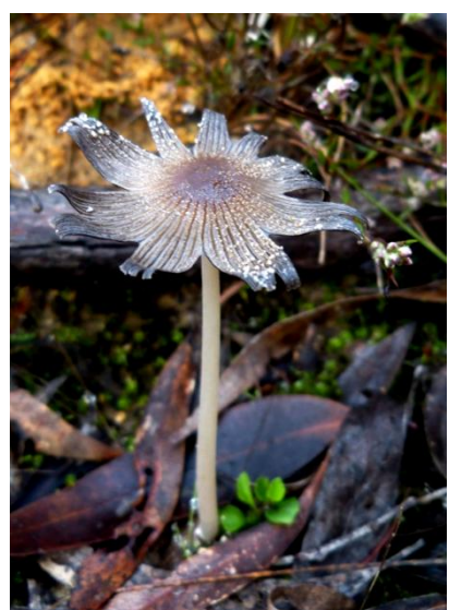
A destructing Rooting Shank

The fungi were of most interest on this morning and we saw possibly 20 species, some of which were photographed (see below). These included Ghost Fungus ( Omphalotus nidiformis ), Yellow Buttons ( Lichenomphalia chromacea ), White Jelly Fungus ( Tremella fuciformis ), Golden Jelly Fungus ( Tremella mesenterica ), Rainbow Fungus ( Trametes versicolour ) and many more.