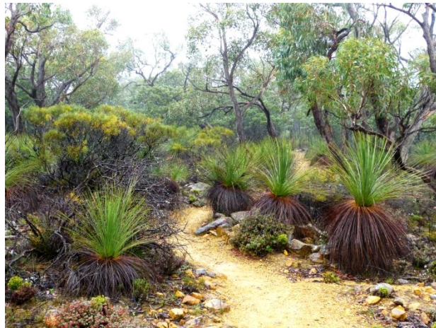
Xanthorrhoea australis near the summit