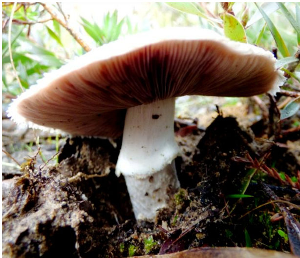
Mushroom – Agaricus sp.