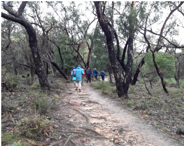
The start to the Piccaninny Trail

At this time of year we expected to see many fungi but few birds or flowering plants. That proved to be the case. The main plants in flower were Common Heath ( Epacris impressa ), Flame Heath ( Stenantha conostephioides ), Bearded Heath ( Leucopogon ericoides ) and 3 species of orchid – Banded Greenhood ( Pterostylis sanguinea ), Red-tipped Greenhood ( Pterostylis parvifolius ) and Mosquito Orchid ( Acianthus pusillus ). The orchids were seen only in 3 discrete places alongside the 2.3 km trail to the summit.