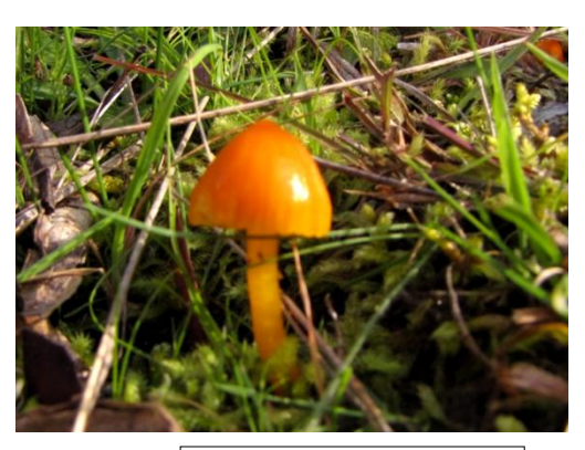
Hygrocybe sp. (Waxy-gill)