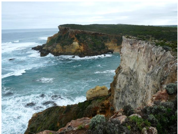
Looking over Murnanes Bay to Childers Cove