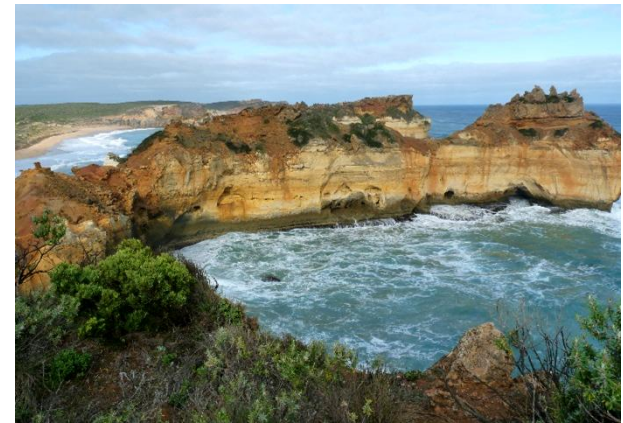
Looking east from Murnanes Bay cliff top