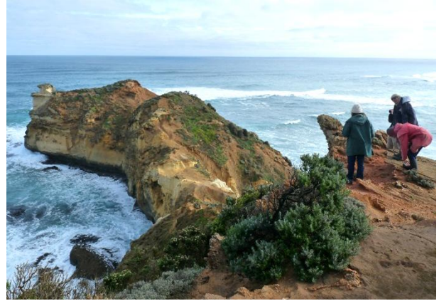
Cliff top at Murnanes Bay