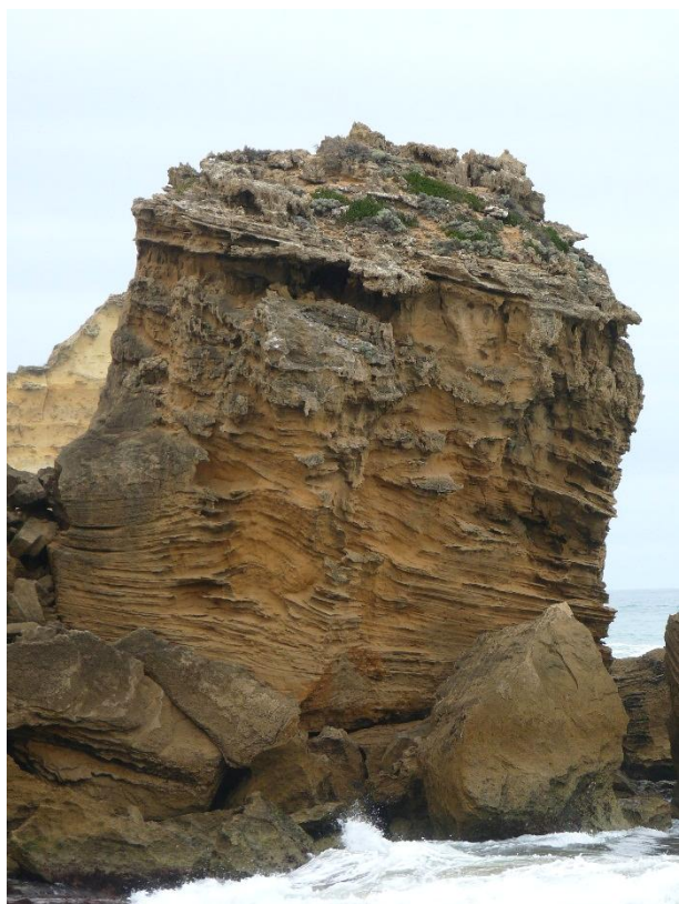
Wind-blown dunal sediments overlying Tertiary limestone deposited in the ocean.

We had 16 people on this outing – one of the largest groups for our excursions in a long while. It was a great day with every one enjoying visiting an unfamiliar place and the sunshine after lunch.