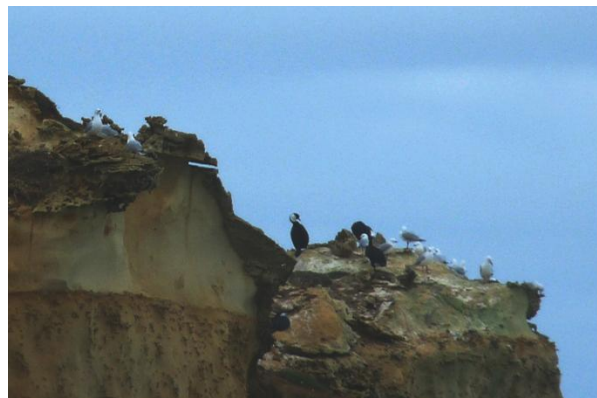
What is this? A petrified camel?