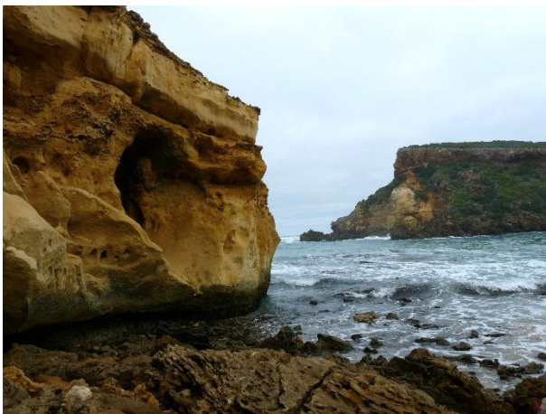
Views of the entrance to the cove.