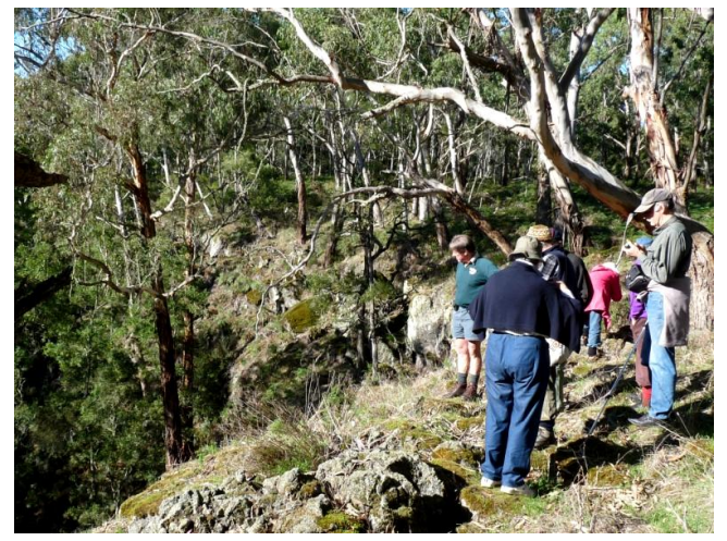
Ranger Gary and HFNC members inspect the Devil's Hole

The second part of the morning – a walk to Elmore's Cone and Natural Bridge – was abandoned as the track was now overgrown with bracken and the way was not clear. Rod was able to provide the GPS location to allow Gary to visit later via the stone fence running east from Cole Track. Many thick and healthy leeches were seen on the ground as we travelled through this thick bracken but none managed to get a feed.