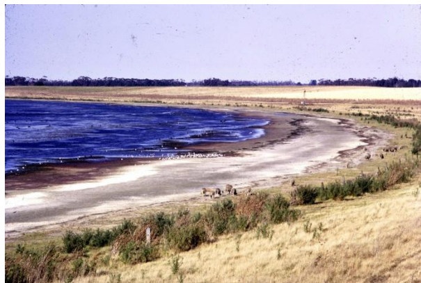
Grazed SE corner of Lake Linlithgow, Jan. 1967 LE