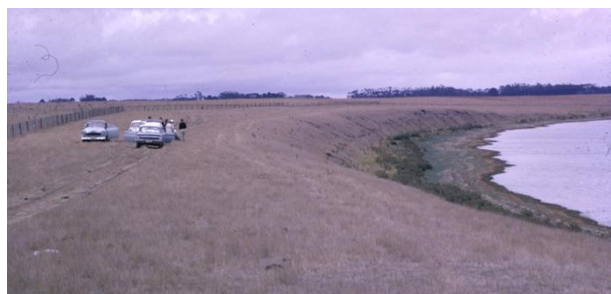
Bare E bank of Lake Linlithgow, March 1966 LE

[For historical purposes, the common names used in the 1960s have been retained in the above list - several differ a little from the accepted names in 2024 – e.g. the Spur-winged Plover is now a Masked Lapwing, the Red-capped Dotterel is now a Red-capped Plover, the Mountain Duck is an Australian Shelduck, the White-headed Stilt is a Black-winged or Pied Stilt and the Mudlark is a Magpie-lark].