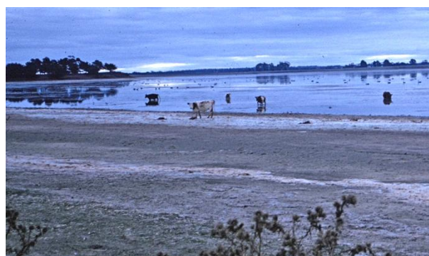
Cattle on SE bank of Lake Linlithgow, June 1967