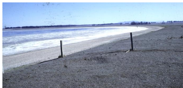
Bare NE bank of Lake Linlithgow, March 1968