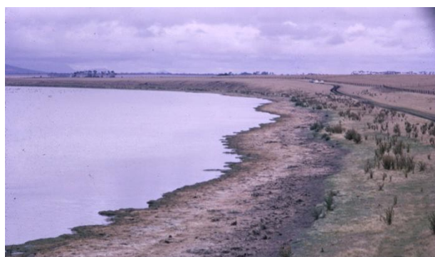
Bare SE bank of Lake Linlithgow, March 1966 LE