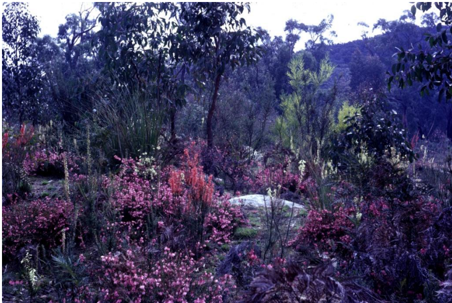
Spring wildflower display in the northern Grampians LE

Several stops were made during the day to look at wildflowers, which were probably at the peak of their season. Thryptomene calycina [Grampians Thryptomene] and Prostanthera rotundifolia [Round-leaf Mintbush] were prominent in the bush. Other species making a colourful display were Grevillea alpina [Mountain Grevillea], G. aquifolium [Holly Grevillea], Eriostemon verrucosus [ Philotheca verrucosa ] (Fairy Wax-flower), Calytrix tetragona (Common Fringe-myrtle), Calytrix alpestris (Snow Myrtle) and Micromyrtis ciliata [Heath-myrtle], as well as smaller plants. Specimens of some flowers from the area were collected and were exhibited later at a club meeting.