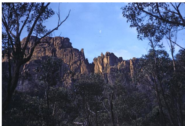
Chimney Pots viewed from the south LE

We had an early lunch in the waterworks clearing and started walking at 12.30. The track was well marked with red metal tags on the trees and led right around the Chimney Pot rock masses. Three members of the party reached the highest point on the Chimney Pot.