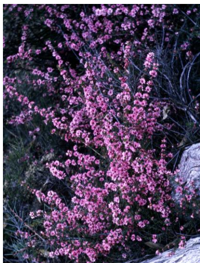
Grampians Bauera at Chimney Pot LE