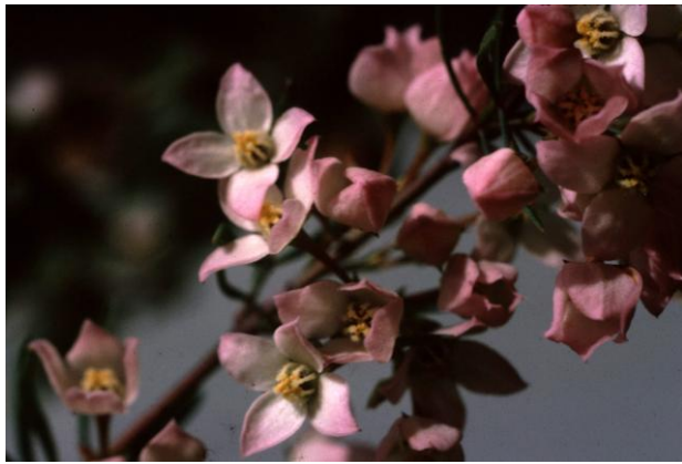
Boronia sp. LE