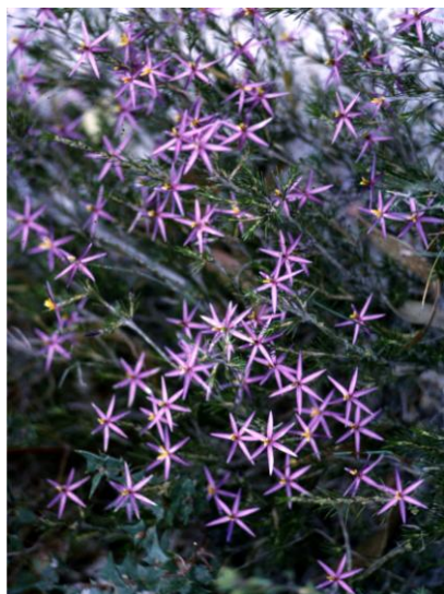
Blue Tinsel-lily LE

The party travelled via Woohlpooer to the intake pond near the Chimney Pot Gap, stopping once at the corner of Harrops Track where a fine patch of Tinsel Lily [ Calectasia intermedia ] was observed.