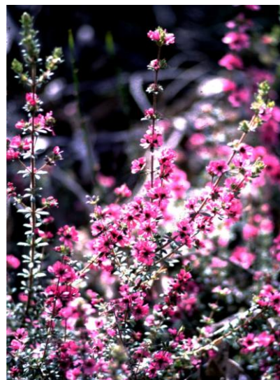
Grampians Bauera LE