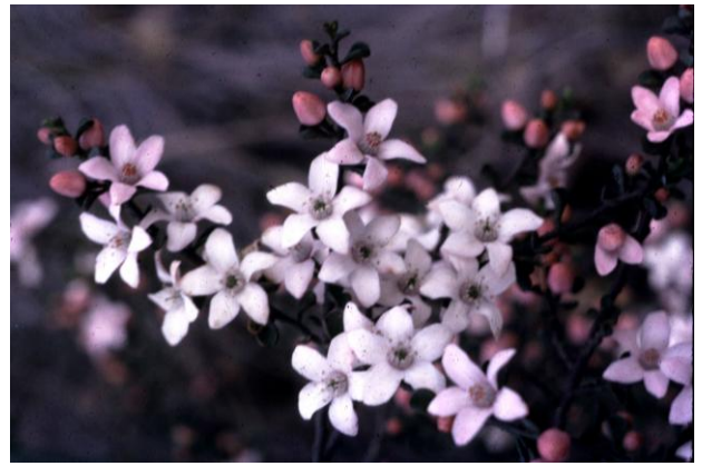
Baeckea sp. LE