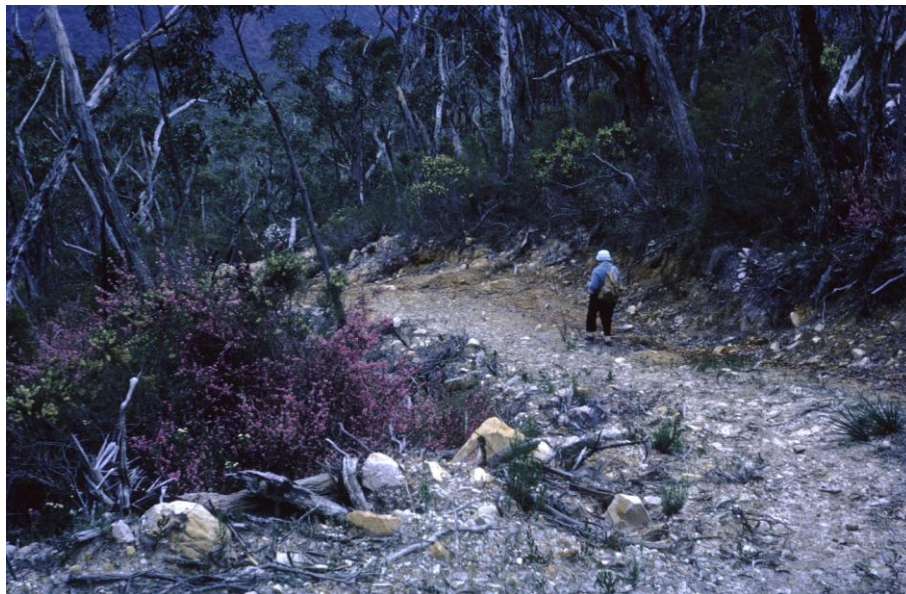
Track near junction of Waterworks track LE