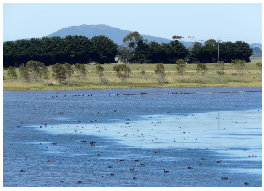
Trees planted on the west side of Lale Linlithgow in 2004 (photo Nov 2011)

Trees planted west of Boonawah creek in 2003 (Photo Nov 2011)