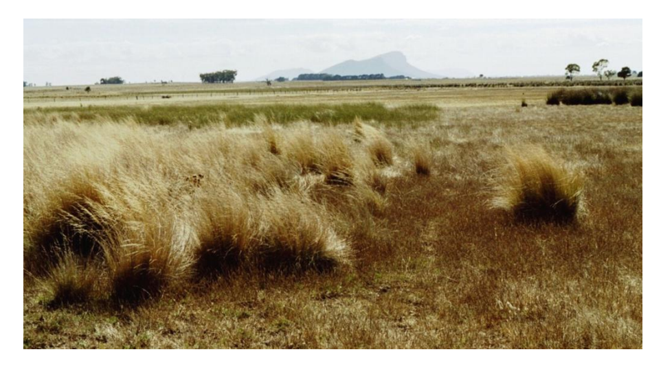
Figure 5 – White Tussock ( Poa labillardiera ) at Boonawah Ck flats in Sept. 2003.

Some Crown land on the Boonawah frontage has, in times past, been absorbed into crop land to the south. That area could have been planted with trees to provide a solid woodlot area for birds, without disturbing the important native grassland that it abuts. The adjacent grassland contains several species of wallaby grass ( Austrodanthonia ), including Austrodanthonia setacea, pilosa, caespitosa and duttoniana , and a number of other species. However, PV made an arrangement with the present landholder to exchange that land for an area of saline land to the east, adjacent to the important area of Gahnia trifida (Coast Saw-sedge), Eragrostis infecunda (Cane-grass) and White Tussock ( Poa labillardia ).