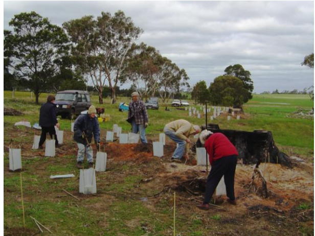
Indigenous trees planted in Sept. 2007 where pines were on SW boundary