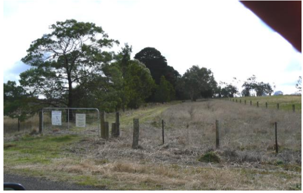
SE end of reserve at Macfarlanes Rd, looking north