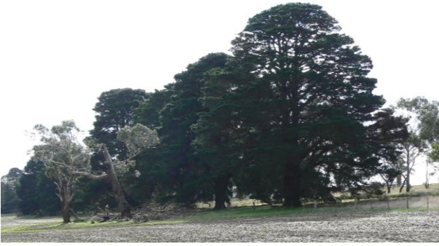
SW end of reserve, looking north – pines were removed later