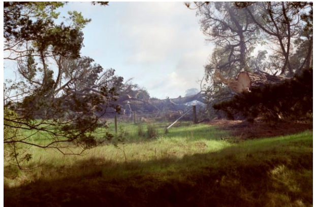
Huge pines felled on SW corner of Station Ground in 2006 – the rail reserve narrows down to the south