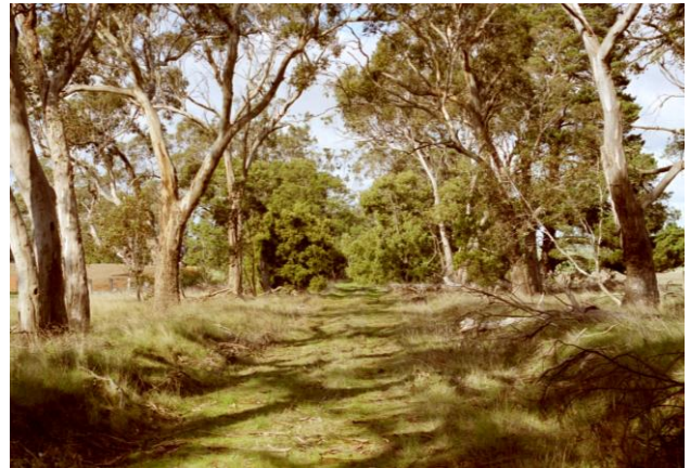
Manna Gum & River Red Gum on east side and centre of the reserve, looking south from the mid-section