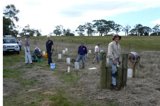
Tree planting at MacFarlanes Rd entrance, Sept. 2006