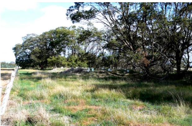
NE corner of the reserve, with Black Wattles.