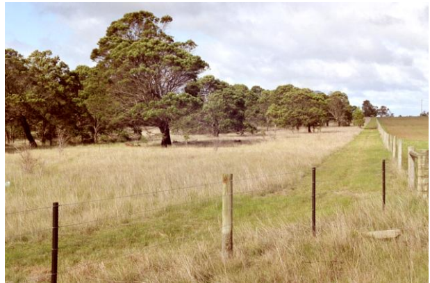
West side of reserve, looking south from Hensley Park Rd.