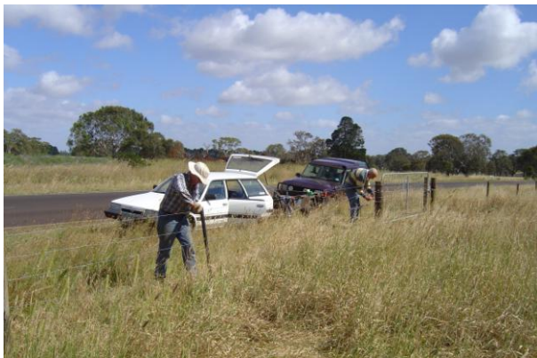
Fencing at Hensley Park Rd Boundary, Sept. 2004