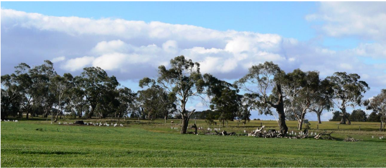
Indigenous trees planted in Sept. 2007 where pines were on SW boundary (as in the previous 4 photographs)