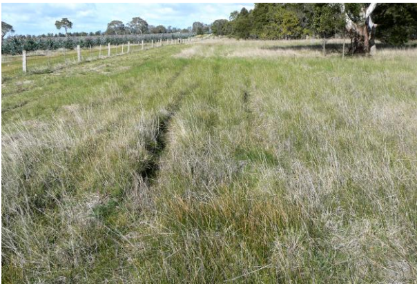
East side of reserve, looking south