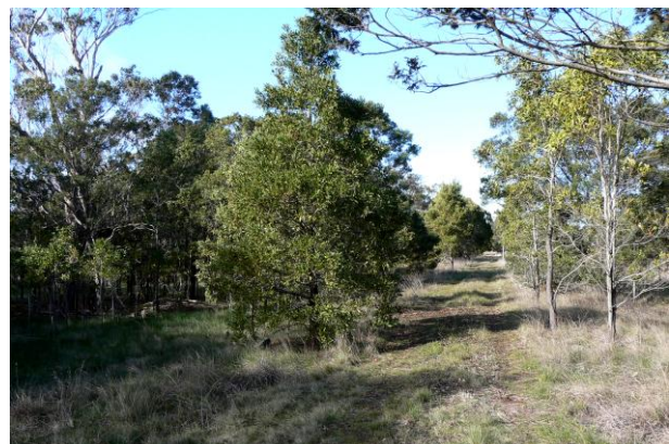
Rail line track through the reserve, with Blackwood s.