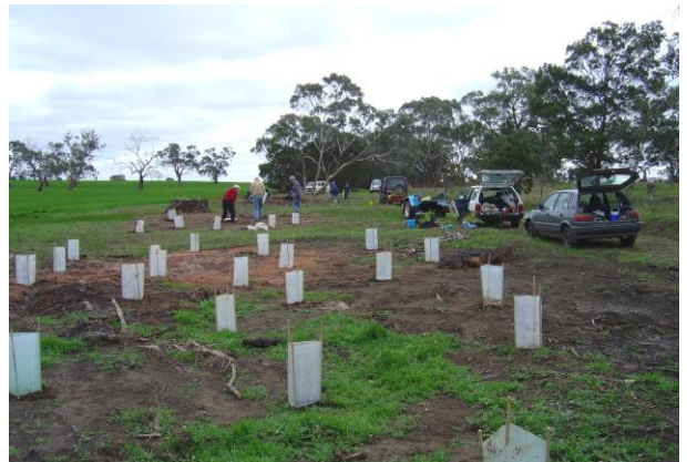
Pines cut down and burned in winter 2006, SW side