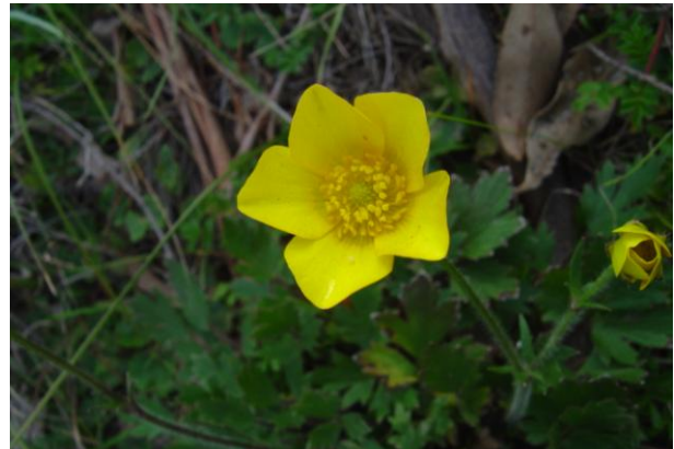
Ranunculus lappaceus (Austral Buttercup)