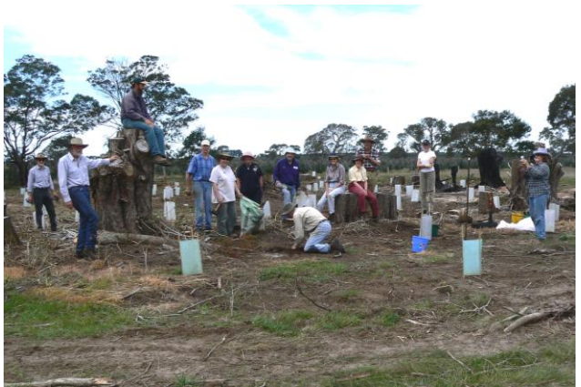
Tree planting in Sept. 2006 at the northern end of the Station Ground, where Cypress and pines were removed.