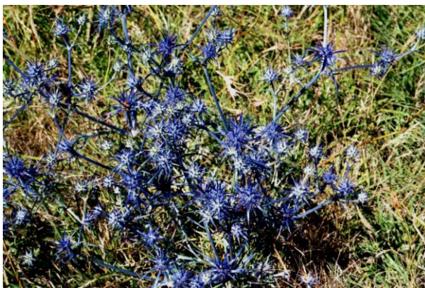
Eryngium ovinum (Blue Devils)