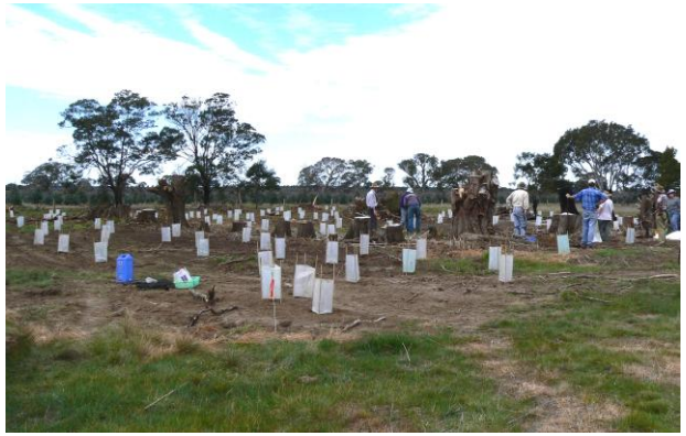
Cypress and pines removed in the Station Ground, east of the Hensley Park gate, and tree planting in Sept. 2006.