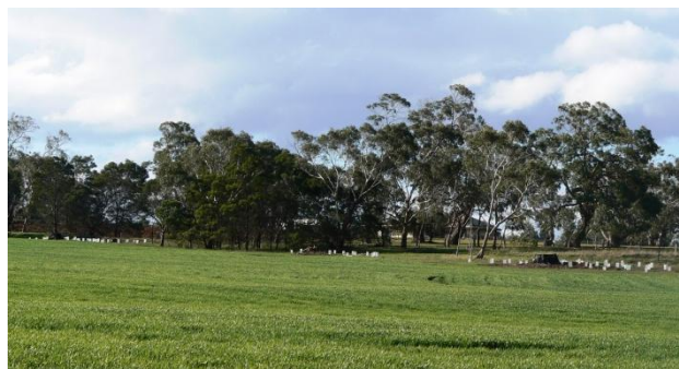
Planting on South end of Kanawalla Res. in Sep. 2007.

The club's focus has now turned more to the problem of environmental weeds on our roadsides and public reserves where Landcare groups do not often operate, there being many issues still to address on private land.