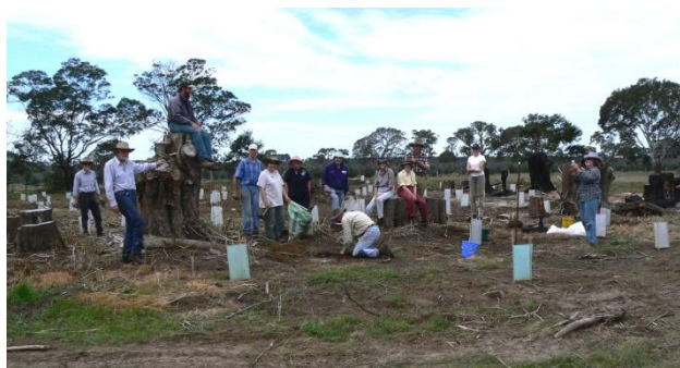
Field Nats at the North end Kanawalla Res Oct. 2006.

The Kanawalla Rail Reserve project (2003-2008) was assisted by GHCMA, DSE, Timbercorp, Jigsaw Farms and our own funds to fence the ends of the reserve and remove over 100 large pine trees (13 had a diameter over 120 cm), 110 smaller pines and 41 old cypress trees. In all, 830 local species of trees were also planted – Bursaria, Silver Banksia (plains form), Blackwood, Drooping Sheoak, Swamp Gum and Manna Gum) – and infestations of Harlequin Flower ( Sparaxis bulbifera ) and Purple Oxalis ( Oxalis purpurea ) attacked.