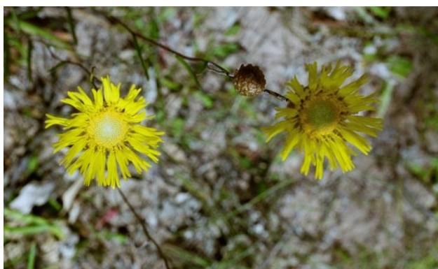
Showy Podolepis on the Fulham heathland.

Members of the club have visited Fulham on several days each Spring since 2006 to conduct weed control works. The collective hours devoted to the works at the site were: 2006 (80 hrs), 2007 (83 hrs), 2008 (72 hrs), 2009 (82 hrs), 2010 (66 hrs), 2011 (111 hrs), 2012 (100 hrs), 2013 (101 hrs) & 2014 (92 hrs).