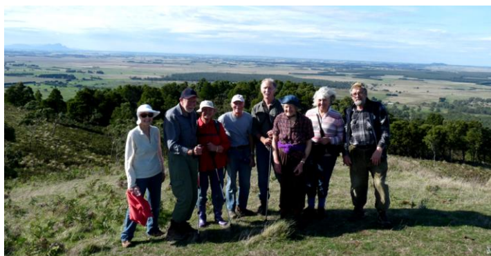
The revegetated NE area of Mt Napier summit in May 2014.

The Kanawalla Rail Reserve project (2003-2008) was assisted by GHCMA, DSE, Timbercorp, Jigsaw Farms and our own funds to fence the ends of the reserve and remove over 100 large pine trees (13 had a diameter over 120 cm), 110 smaller pines and 41 old cypress trees. In all, 830 local species of trees were also planted – Bursaria, Silver Banksia (plains form), Blackwood, Drooping Sheoak, Swamp Gum and Manna Gum) – and infestations of Harlequin Flower ( Sparaxis bulbifera ) and Purple Oxalis ( Oxalis purpurea ) attacked.