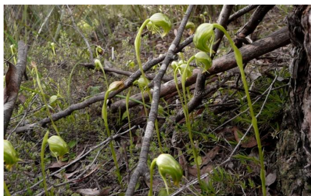
Nodding Greenhoods on the Fulham heathland.

Another nasty weed has emerged in Victoria. This is African Weed Orchid ( Disa bracteata ) (AWO). This pest seems to have invaded SW Victoria in about 2003. It was particularly noticeable first in the Rocklands area. We first saw it on the 12-ha Nigretta Flora Reserve in 2009, where it was abundant. That was our first visit there for several years. This reserve contains over 200 species of native plants and is one of few reserves that now represent the original flora in the district.