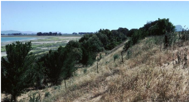
1990/91 planting at Lake Linlithgow, seen in Dec. 2000.

HFNC assisted the Lake Linlithgow restoration project of John Harris (ParksVictoria) from 2003, when we planted 600 trees and shrubs grown from local sources (Silver Banksia, Sweet Bursaria, Tree Violet and Austral Hollyhock) at the northern end of the lake. In 2004 and 2005 we planted a further 340 trees, on the western flank of the lake. Meanwhile, the late John Harris had achieved a dream – boundaries secured, local trees planted and livestock removed from the 1,447-ha Lake Reserve that includes the 1,015 ha lake bed.