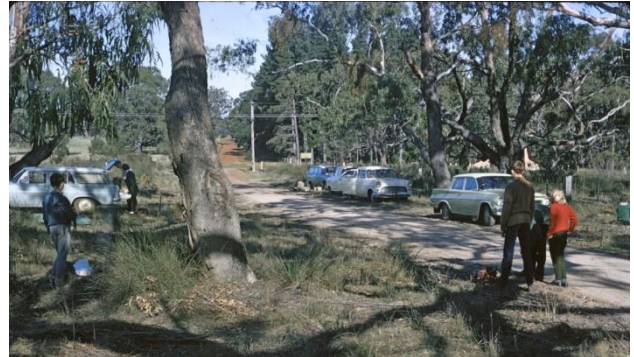
HFNC working bee, "18-acre Reserve", June 1965).

Later projects include the restoration of local vegetation at Wannan Falls Scenic Reserve (the 30-acre pine plantation area), the 1.2 km Kanawalla Rail Reserve and more tree-planting at Lake Linlithgow.