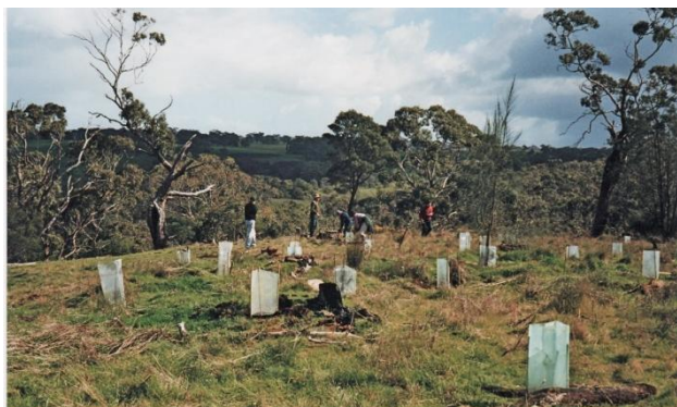
1998 planting at Wannan Falls Scenic Reserve.

From 1994-1999 the club planted 1,182 trees at the Wannan Falls Scenic Reserve on the site of the old pine plantation, off Morgiana Rd. The species were Blackwood, Manna Gum, Drooping Sheoak and Bursaria, grown from local sources by the members. Most of the planted trees survived and there has been a substantial natural regeneration of native ground flora.