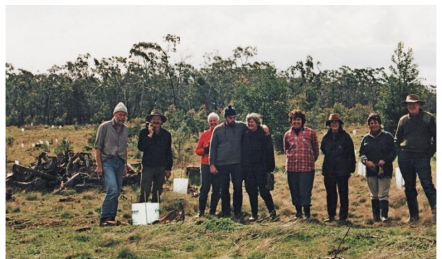
1998 planting at Wannan Falls Scenic Reserve.