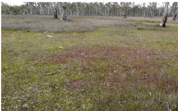
Older & recent areas bared by Tulip spraying at Fulham.

The damage done to native vegetation by using large-scale spraying equipment to spray Cape Tulip ( Moraea flaccida ) at the Fulham Streamside Reserve became apparent to us in 2005 when the club visited the area. We were appalled at the effect of the spraying that killed swathes of native vegetation on the heathland areas but appeared to leave most of the Cape Tulip alive! The 860-ha Fulham Reserve has 325 native plant species and is one of the best conservation sites in SW Victoria. That sort of damage was clearly unacceptable.