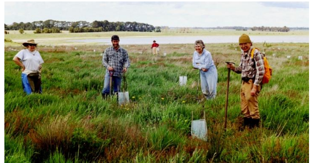
Sep. 2004 planting at Lake Linlithgow, off Nth Lakes Rd.

From 1994-1999 the club planted 1,182 trees at the Wannan Falls Scenic Reserve on the site of the old pine plantation, off Morgiana Rd. The species were Blackwood, Manna Gum, Drooping Sheoak and Bursaria, grown from local sources by the members. Most of the planted trees survived and there has been a substantial natural regeneration of native ground flora.