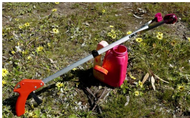
A better way – a tool for herbicide-wiping of Cape Tulip.